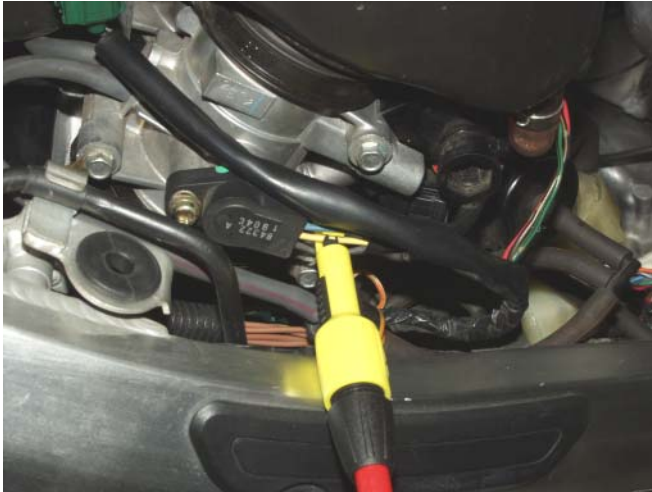
Figure 4 – TPS Signal Hookup

Temporary tach and analog signal (TPS) connections can be made with insulation piercing test clips as shown in Figures 2, 4, and 5. Once you use these, you will wonder how you ever got along without them. The best type is the Pomona 6405. These lock onto the wire. A set of the Pomona test clips is available from Newark as their P/N 23C2020. They also sell extended reach versions (refer to the data sheet available on the Diagnostic Tools and Suppliers Tech FAQ on our website at www.daytona-sensors.com ). You will need banana plugs to connect the insulation piercing test clips to the WEGO. These are available from Newark as P/N 39F1531 (red) and 39F1532 (black).