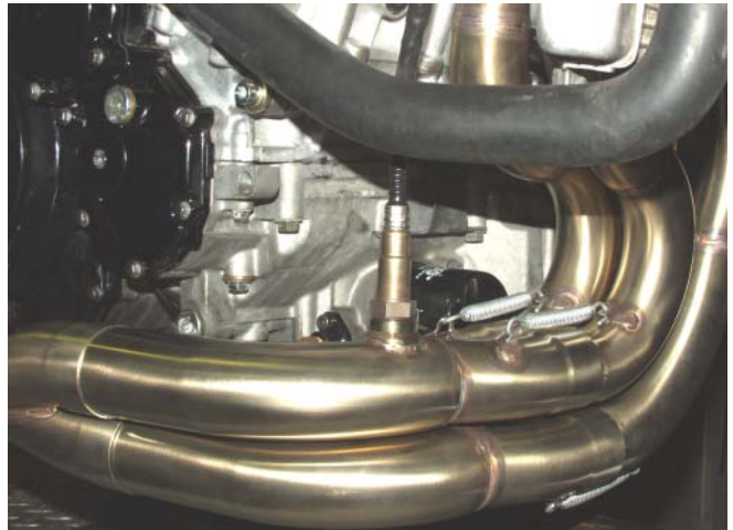
Figure 6 – Bosch Sensor Installation

18 x 1.5 mm weld nuts must be welded onto the header pipes. After welding, run an 18 x 1.5 mm tap through the threads. Failure to clean the threads may result in sensor damage. Do not install the sensor until after the free air calibration procedure described in the WEGO instructions. Always use an anti-seize lubricant such as Permatex 133A on the sensor threads.