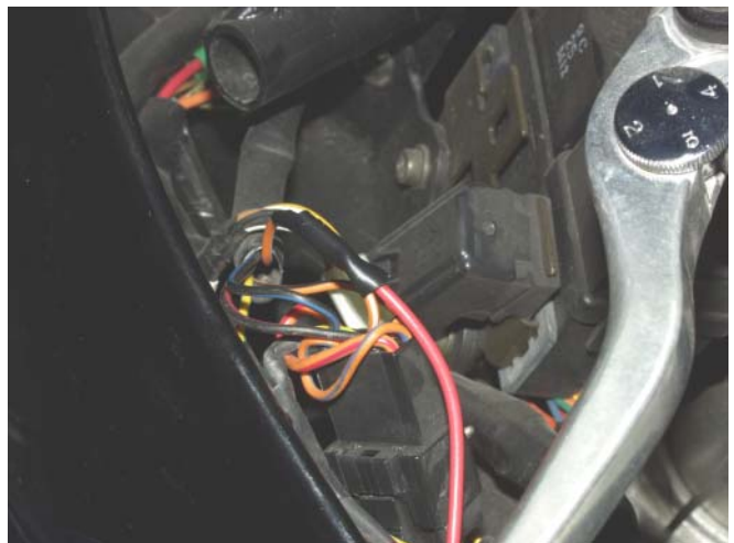
Figure 3 – Power Hookup

Connect the red wire from the WEGO to a switched +12V power wire (orange/white) near the instrument cluster as shown in Figure 3. Solder this connection (preferred) or use quick disconnect terminals.