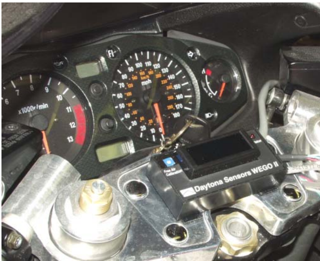
Figure 1 – WEGO Installation

Connect the black ground wire from the WEGO to the battery minus terminal as shown in Figure 2. Connect the brown tach wire from the WEGO to the #1 COIL- wire (blue/white) at the ECM.