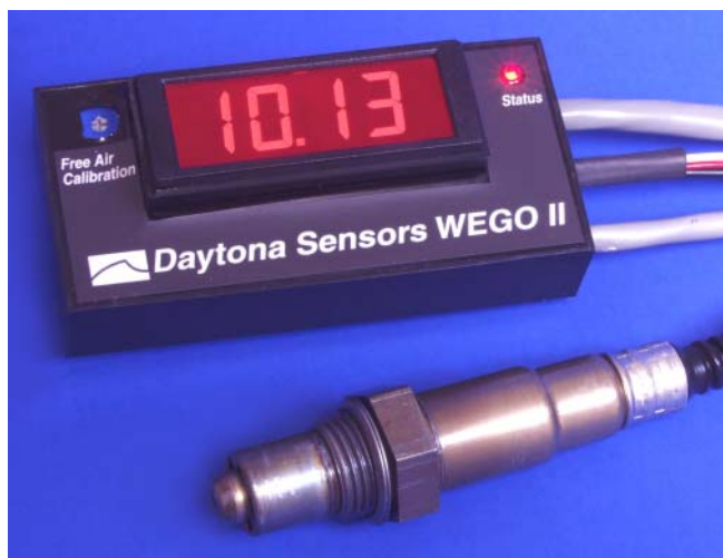
Figure 2 - WEGO II Unit

The free air calibration procedure should be performed at reasonable intervals (every 250-500 hours) or whenever the sensor is replaced. If you cannot get the LED to flash when the trimpot is turned full clockwise, you either have a damaged sensor or very high hydrocarbon levels in your environment.