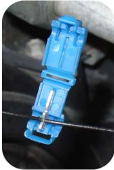
Figure 3 (T-Tap connector installation)