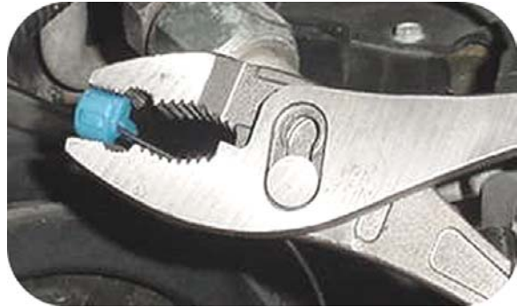
Figure 4 (Close T-Tap connector)

If you have any questions regarding the performance of your kit, call NOS Technical Service at 1-866-GOHOLLEY.