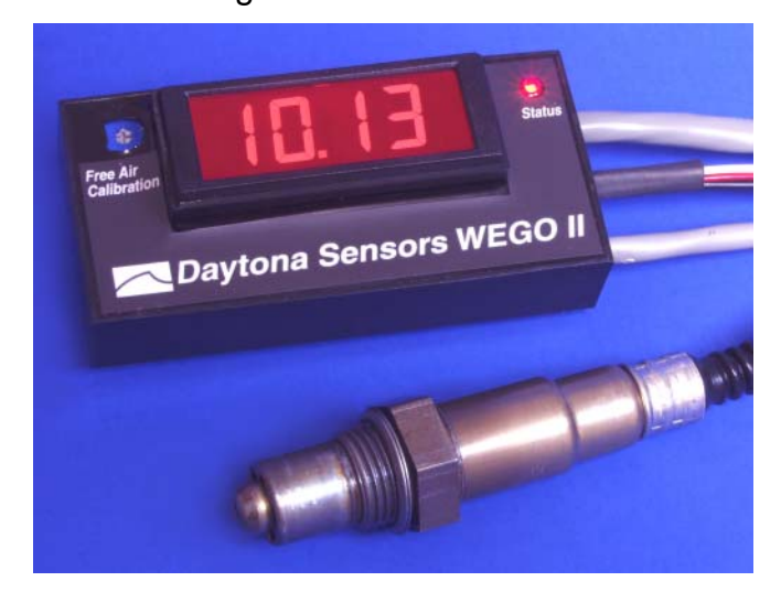
Figure 2 - WEGO II Unit

After installation, the WEGO II system requires free air calibration. This should be done with the sensor dangling in free air. The environment must be free of hydrocarbon vapors. We suggest that you perform the free air calibration outdoors. Turn the free air adjustment trimpot on the WEGO II full