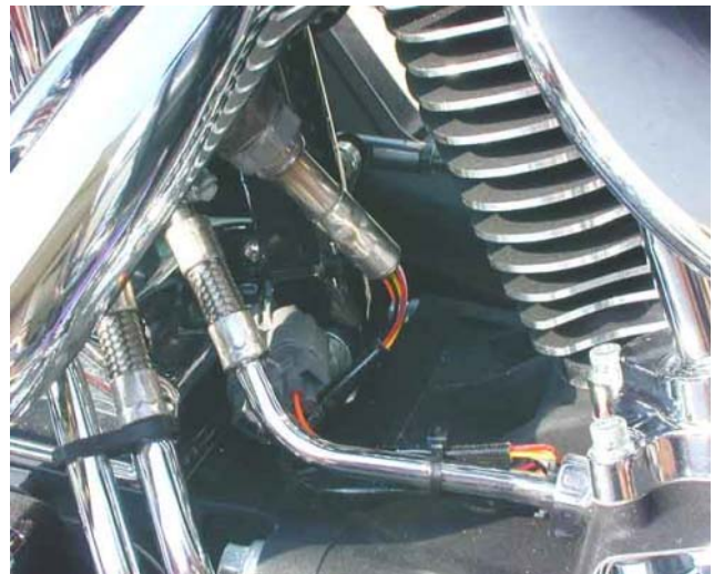
Figure 1 – Typical Sensor Installation