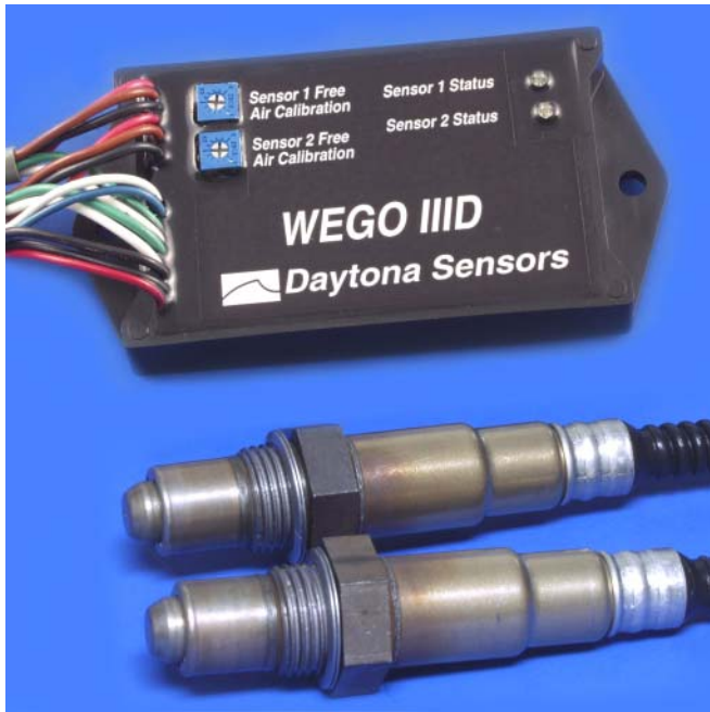
Figure 3 - WEGO Unit

The WEGO includes internal diagnostics for abnormal battery voltage (less than 11 volts or greater than 16.5 volts), sensor open circuit, and sensor short circuit conditions. A fault condition causes the status LEDs to blink at the slow rate.