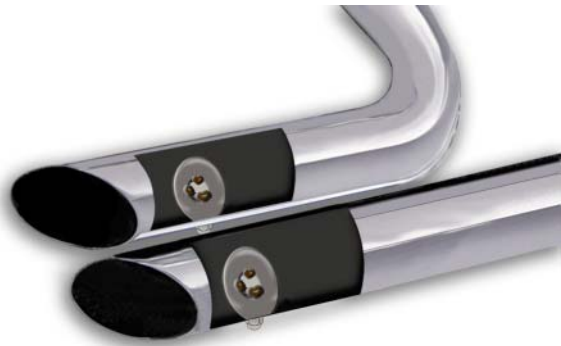
Figure 4 – Exhaust Mod to Reduce Reversion

Use washers with an OD that is 2/3 to 3/4 the ID of the pipe (for example, 1-1/2" OD washers are suitable for pipes with an ID of 2" to 2.25"). Weld ¼-20 socket head cap screws to the washers as shown. Drill holes at the bottom of the pipes about 2" from the end and use decorative acorn nuts to secure the washer assemblies. We suggest that you use stainless steel hardware.