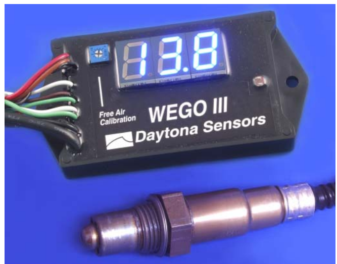
Figure 2 - WEGO III Unit

The free air calibration procedure should be performed at reasonable intervals (every 250-500 hours) or whenever the sensor is replaced. If you cannot get the display to indicate "FA" when the trimpot