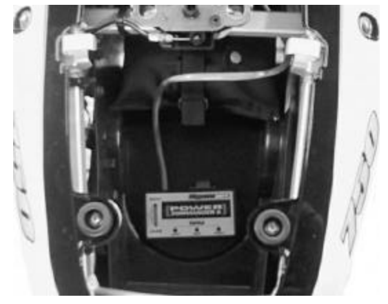
Attach the Power Commander II with the velcro In this area

Your Power Commander has been programmed with a base map for your application. You can adjust the base map or install an alternate map using your Computer. Please refer to the supplied CD-Rom for more information.