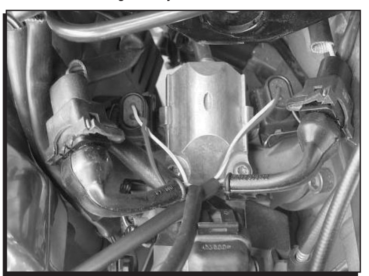
Figure 2 Injector Connections.