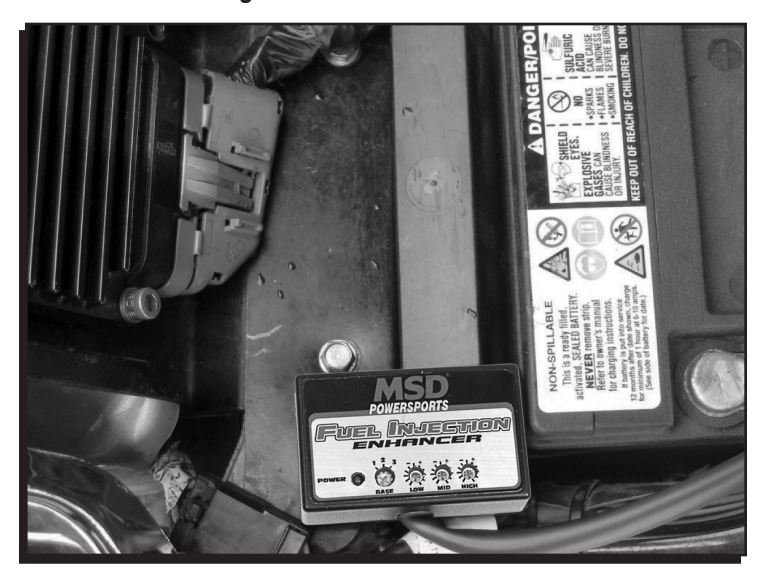
Figure 6 Mounting the Enhancer.