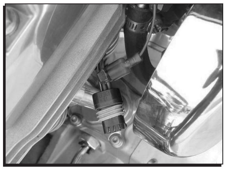
Figure 4 TPS Connection.