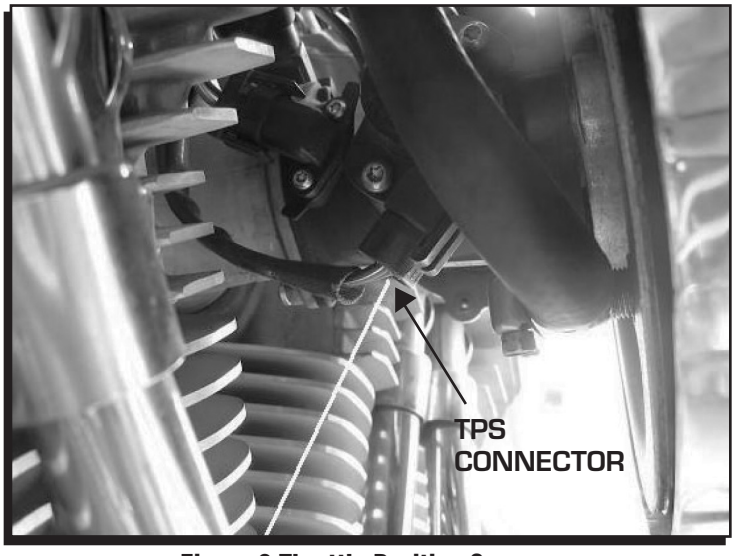
Figure 3 Throttle Position Sensor.