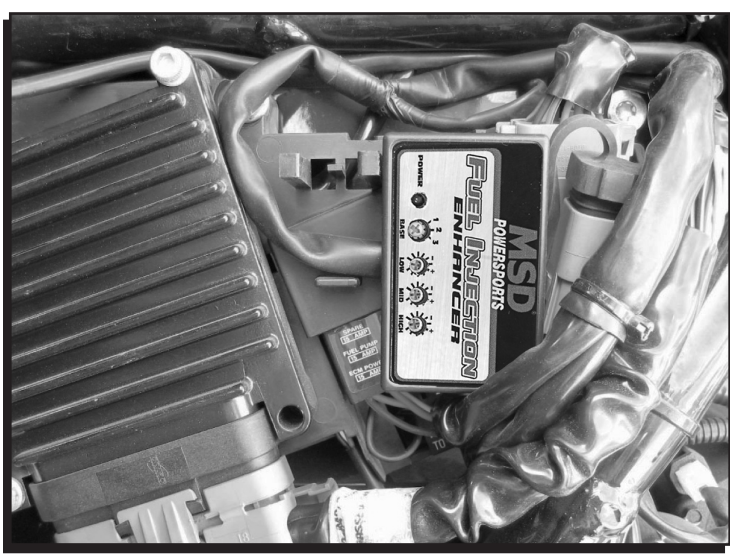
Figure 6 Mounting the Enhancer.