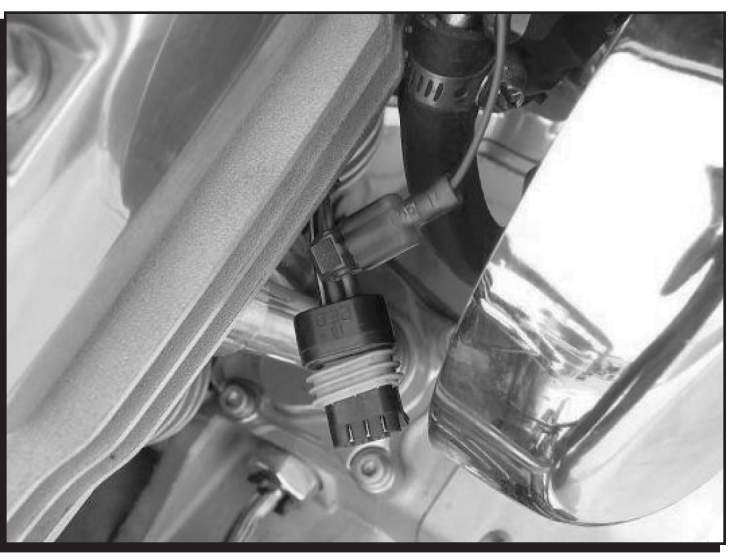
Figure 4 TPS Connection.