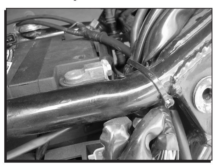
Figure 5 Secure the Harness.