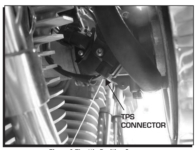
Figure 3 Throttle Position Sensor.