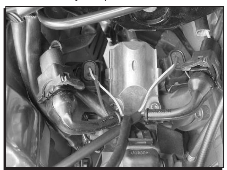
Figure 2 Injector Connections.