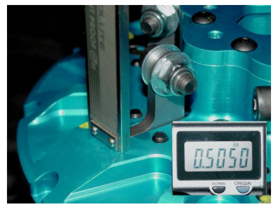
Fig. 1 Fig. 2

ClutchSupport@mtceng.com Order Line: 1-800-827-9210