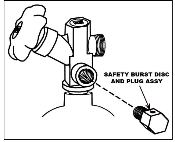
Figure 1 IN 16169NOS ONLY: