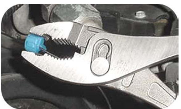
Figure 4 (Close T-Tap connector)

If you have any questions regarding the performance of your kit, call NOS Technical Service at 1-866-GOHOLLEY.