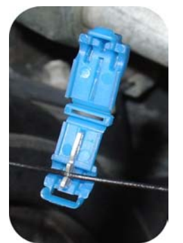
Figure 3 (T-Tap connector installation)