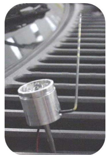
Figure 1 (Tighten set screw)